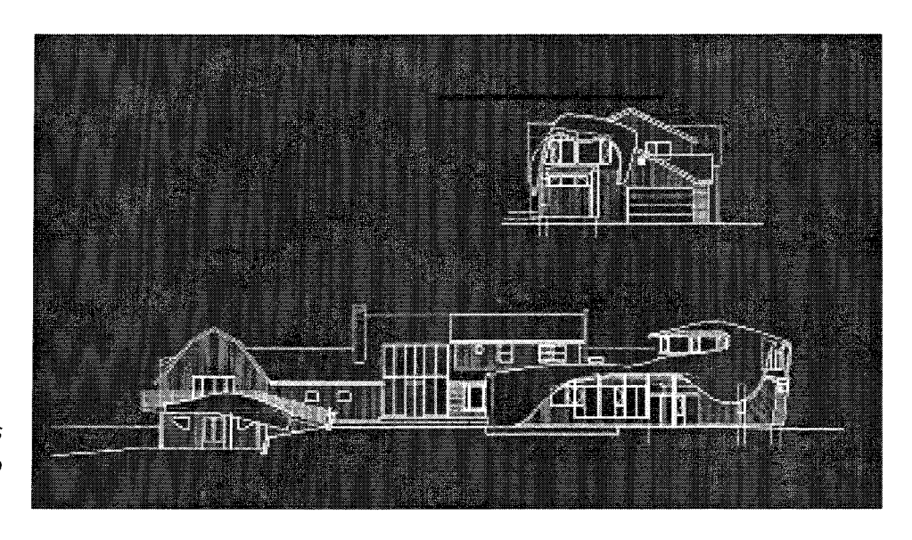
Fig. 2. Elevation Studies (Image Courtesy of Garafalo Achitects).

While the intention of the addition is to form a small, defined village, it is equally important to open the complex to the four present landscape types: forest, prairie, lawn and picturesque garden. These landscapes form a surprisingly hybrid landscape considering the rural surroundings (Fig. 1).